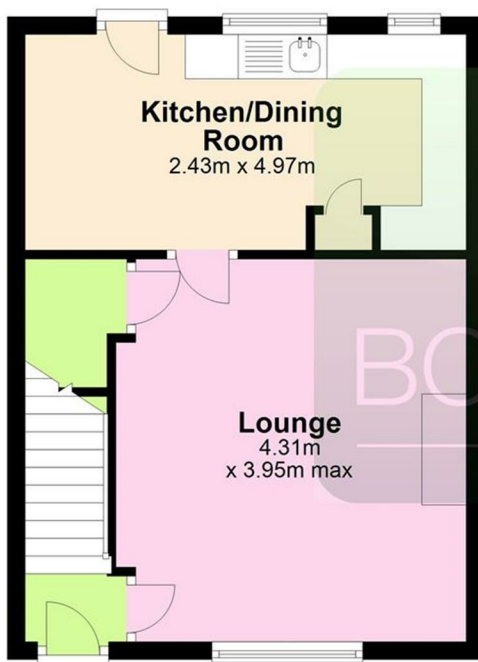
Ground Floor Approx. 34.0 sq. metres